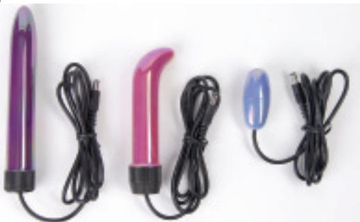
Slimline Vibe G-Spot Vibe Vibrating Love Bullet®