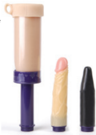
PassionSkin® Stroker for Him

To fully enjoy your pleasure attachments, use a generous amount of water-based lubricant.