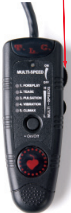
Remote control unit

You control the speed of this action by turning the dial up or down.