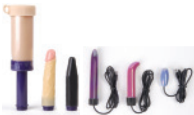
Six attachments and accessories included!